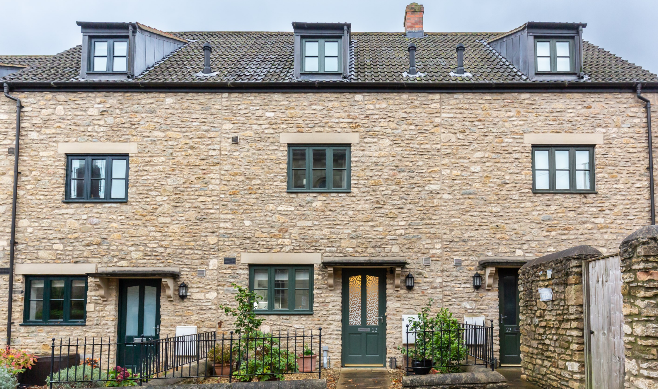
South Parade, Frome.